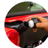
5. High-capacity fuel tank