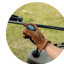
6. Front-end loader joystick lever