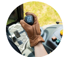
6. Front-end loader joystick lever