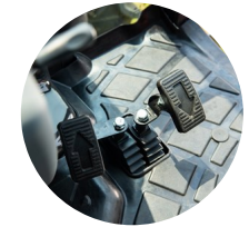
4. Highly responsive forward & reverse HST (5520CH)