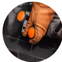
3. Ergonomic lever