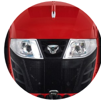
1. Hood design

High performance meets efficiency in this highly customizable compact tractor that has the power to support your productivity.