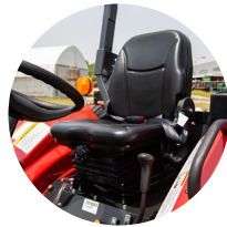
2. Comfortable suspension seat