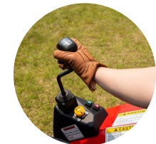
6. Front-end loader joystick lever