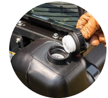
5. High-capacity fuel tank