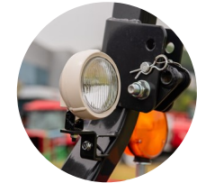
4. Rear work light