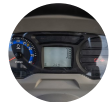
6. Digital instrument panel