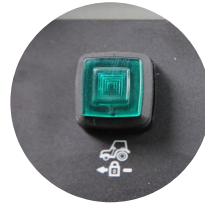
1. Cruise control switch

Take on tough jobs in tight spaces with the T495. This tractor brings you the best features from our compact and utility ranges, balancing high power output with maximized maneuverability.