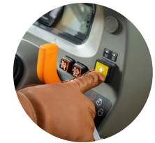
5. PTO switch