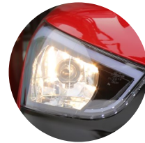
2. Projection headlights