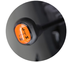
4. 3-range HST & 8F x 8R gear transmission