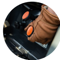
3. Ergonomic lever