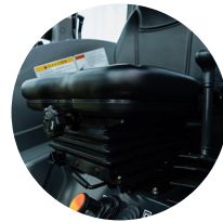
2. Comfortable suspension seat