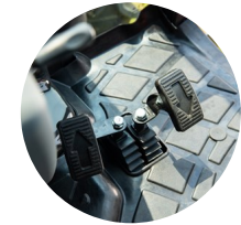
4. Highly responsive forward & reverse HST (5025CH)