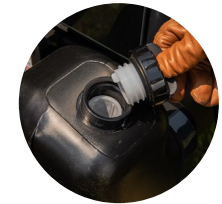
5. High-capacity fuel tank