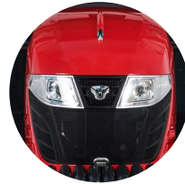
1. Hood design

High performance meets efficiency in this highly customizable Series 3 tractor that has the power to support your productivity.