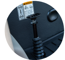
5. Differential lock system