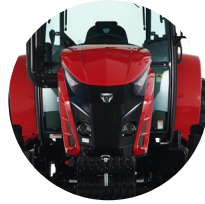
1. Tiger face front fascia

The T68 is the result of TYM's decades-long experience in the agricultural equipment industry and the embodiment of TYM's philosophy on technology, design, and agriculture.