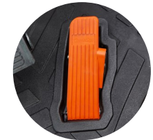
5. Electronic Floor-mount pedal