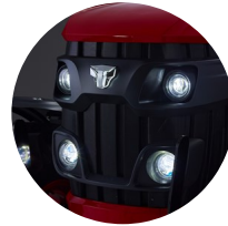
1. Refined hood design

Take utilization to the next level with one of the largest TYM tractors. The T115 is equipped to tackle the toughest of jobs with maximized productivity.