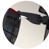
2. LED Dual side mirrors