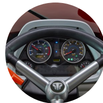
3. Digital instrument panel