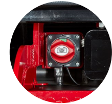
4. Battery shut-off switch