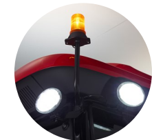
6. Side & rear LED work lights