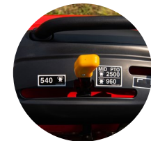
5. PTO lever